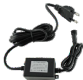
3W LED Driver - DC12V Input 90-260VAC 50/60Hz - IP67 53 mm x 35mm x 23mm