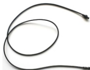
Extension Cable 2m 2 pin cable with waterproof connections.