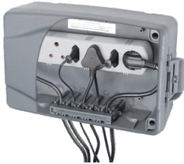
SAWBX-MP 13.5cm x 22.5cm x 35.5cm 2Kg