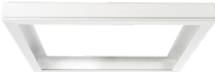
LP612SMF - Surface mounting frame