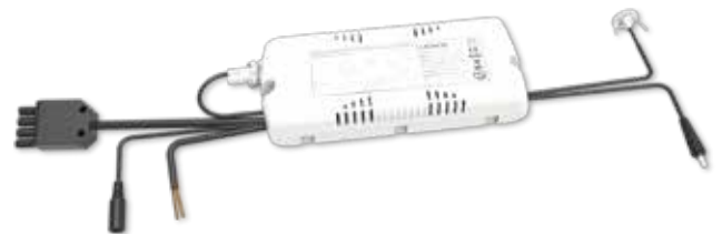
LED3EP80 - Emergency pack

Tech Help Line UK - 0845 194 7584 Non UK - +44 (0)1952 238 100